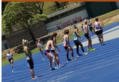
Pic from Relay Day 2019