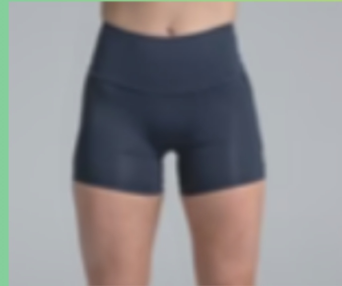
Women's compression short