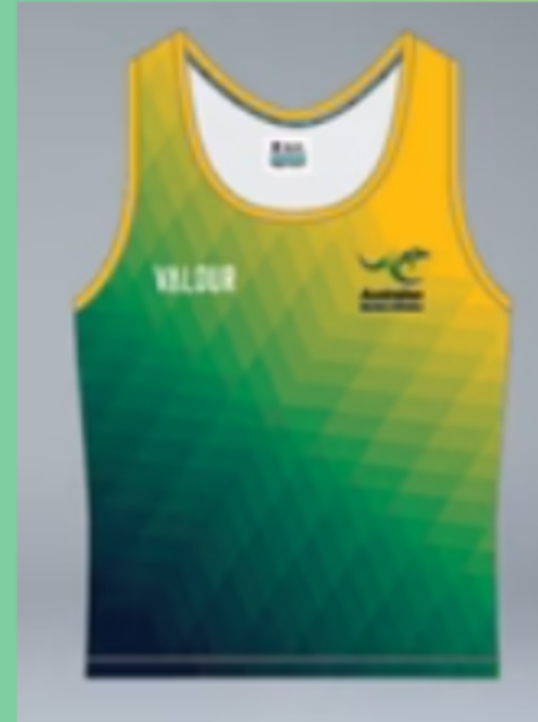
Long Crop Singlet