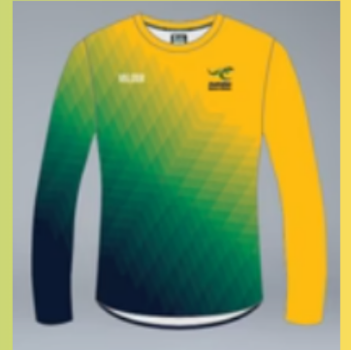
Training Long sleeve